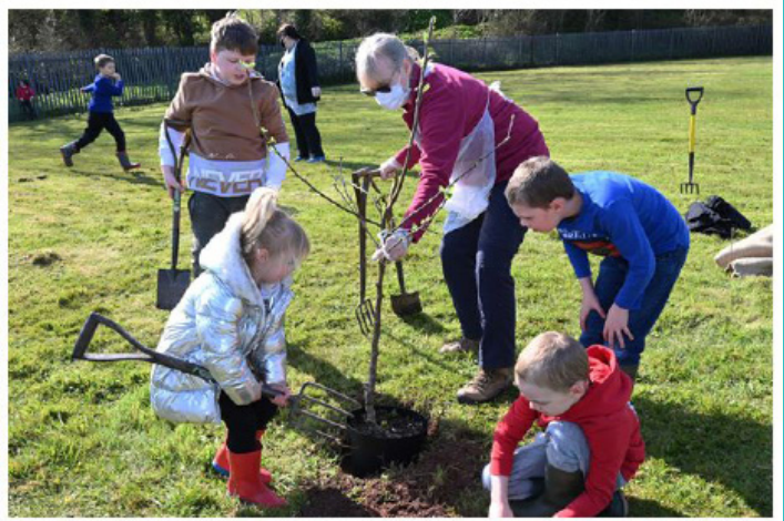
Coastal Communities Growing Together, tree planting, Pembrokeshire, March 2021