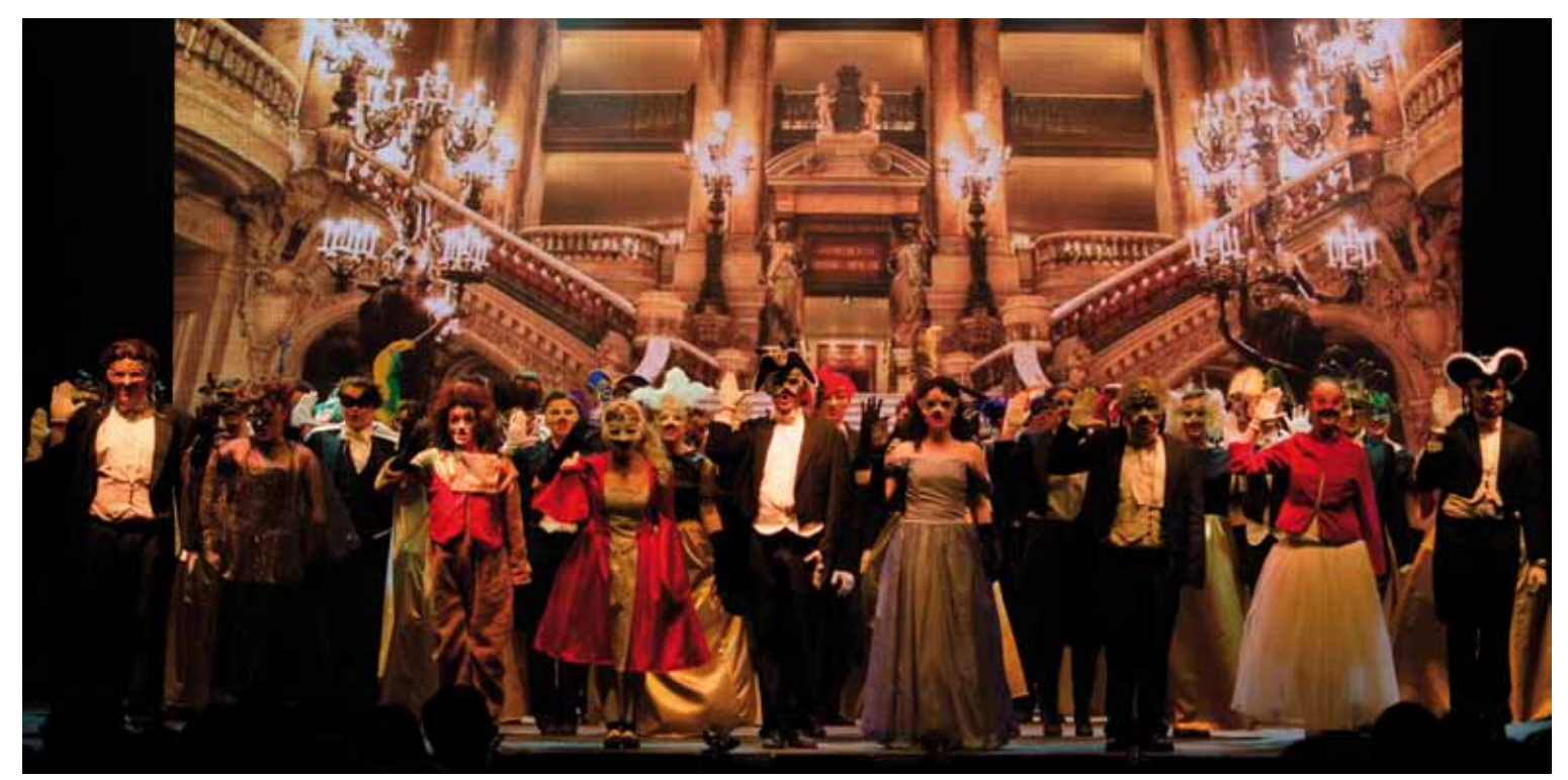
Members of the cast of the UCD Community Musical perform the masquerade ball scene on stage in O'Reilly Hall, during one of the six performances of The Phantom of the Opera staged in February