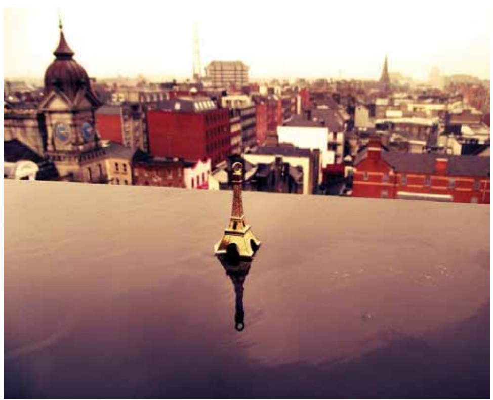
Photo of 'Paris à Dublin' by student of French, Sorcha Cusack, winner of UCD French Week Photo Competition 2013