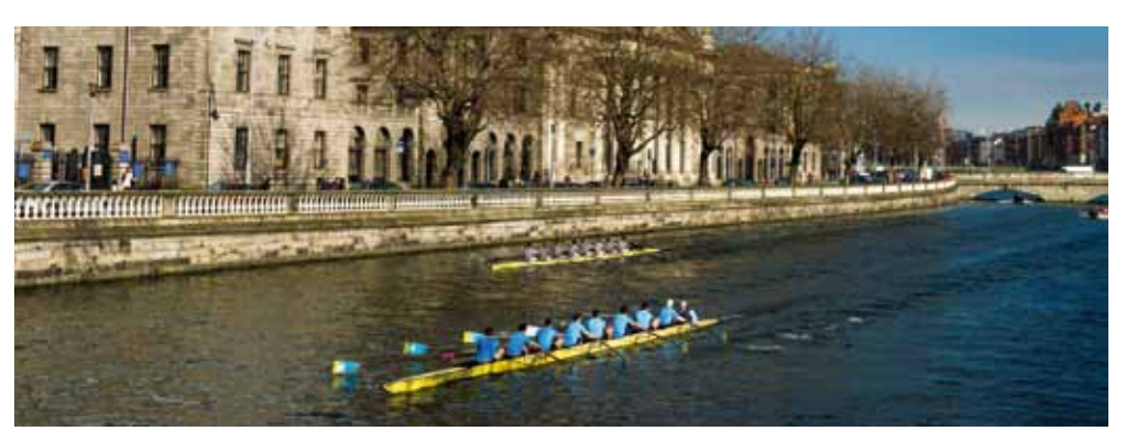
University College Dublin (foreground) and Trinity College Dublin Senior Men's in action in the Gannon Cup along the River Liffey on March 16th as part of the annual Colours boat races