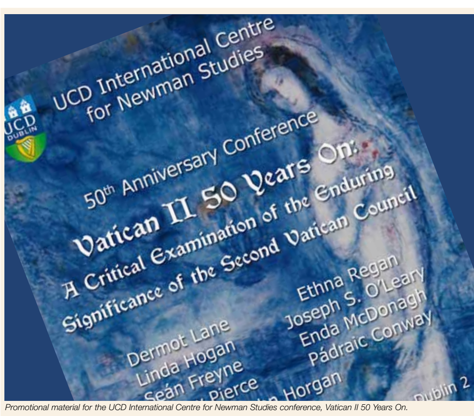
Promotional material for the UCD International Centre for Newman Studies conference, Vatican II 50 Years On.